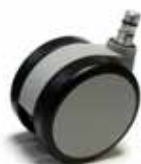
Soft Wheel Casters