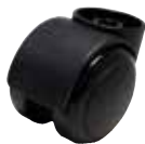
Hard Wheel Casters with wide base