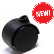
Hard Wheel Casters